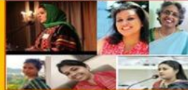
Our Distinguished Resource Persons Speakers